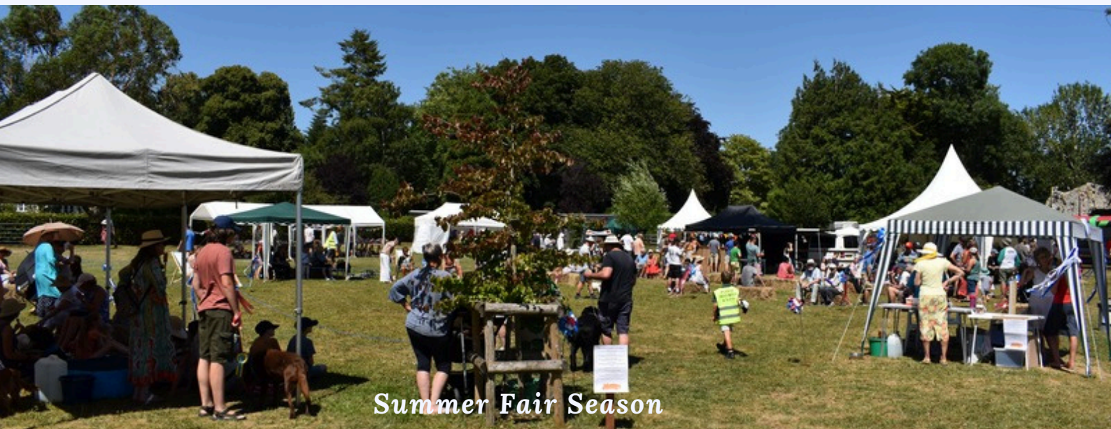
Summer Fair Season

A newsletter contributed to by the staff and children of Witchampton and Pamphill First Schools